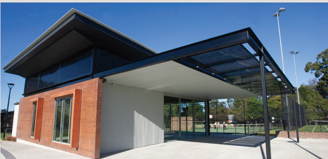
Buildings which meet modern access, amenity and energy-efficiency standards.