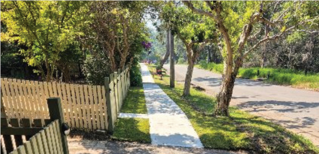
Improving accessibility by renewing existing footpaths, including removing trip hazards, and building new footpaths.