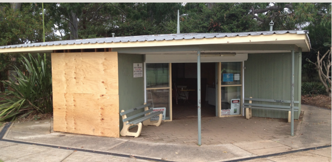
More than 50% of Ku-ring-gai’s public buildings need to be refurbished, or demolished and rebuilt.