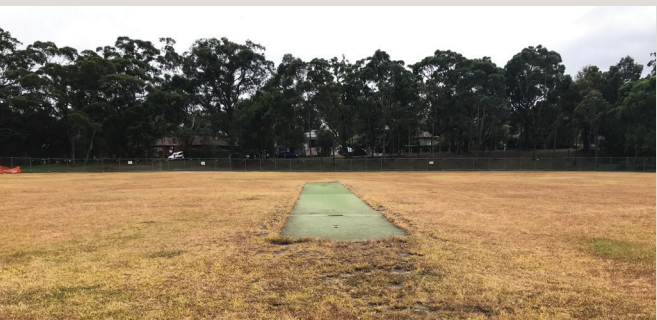
Limited funding to renew parks, sportsfields, courts and recreational facilities.