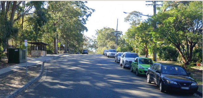
Limited funding to deliver traffic and transport improvements.