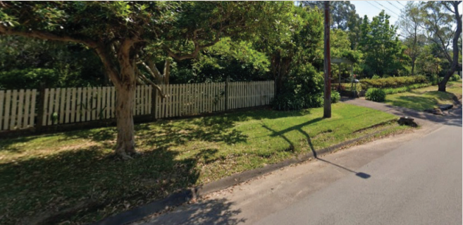
Around 250km of streets lack footpaths, and existing footpaths are deteriorating.