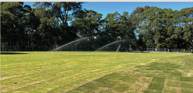
Better playing surfaces, lighting, pathways and fencing at sports and recreational facilities.