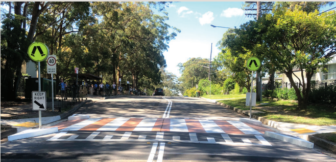
More traffic and transport improvements for safer journeys.